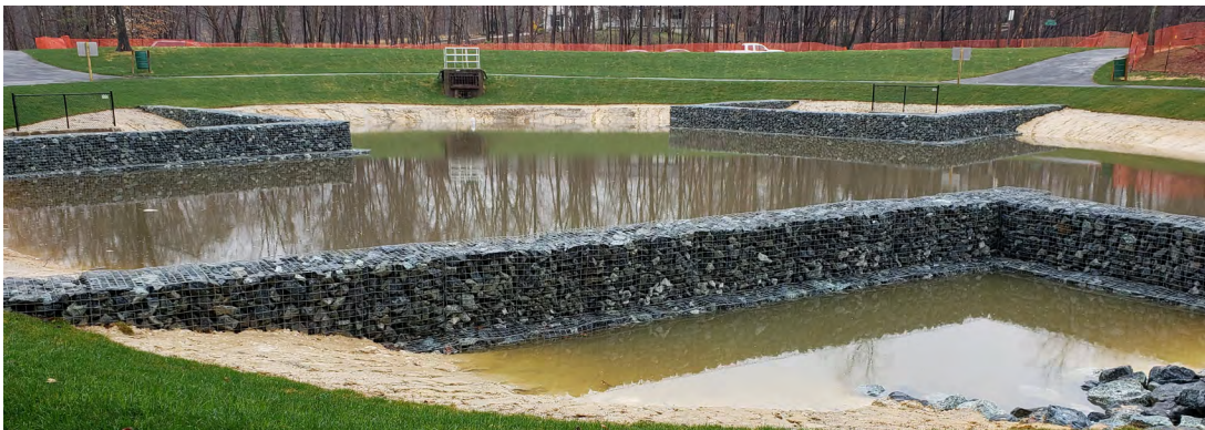
Old Chapel Park Bio Retention Pond