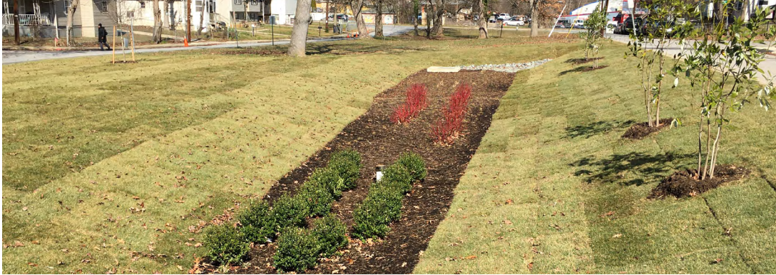
61st Avenue Fairmount Heights Micro Bio Retention Pond