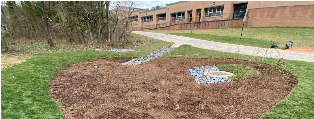
Greenbelt Elementary School Micro Bio Retention Basin