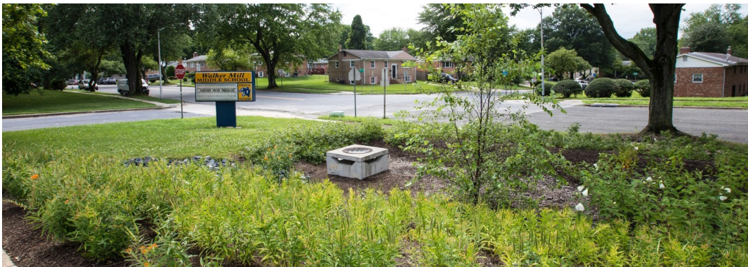
Walker Mill Middle School Micro-bioretenion & Swale