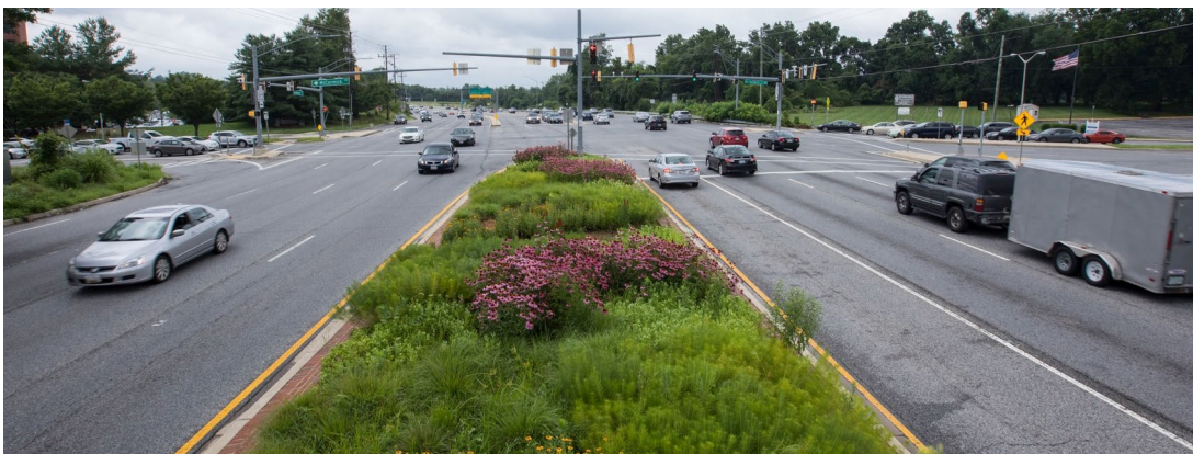
CWP Maintenance Transfer Site Median Route 202