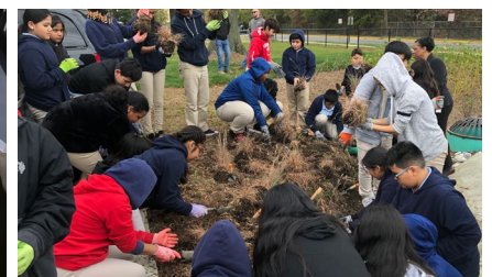
2 Rogers Heights Elementary School Planting Event