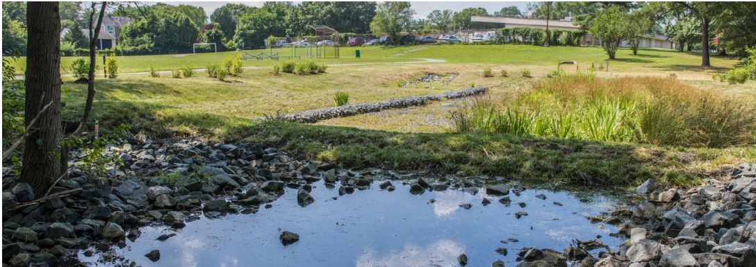
Barlowe Road Police Dept. Bio Retention Porous Paver