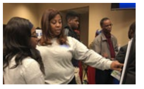
2 Community Outreach team speaks with community members at the Laurel Open House

CWP team visits the National Museum of African American History and Culture