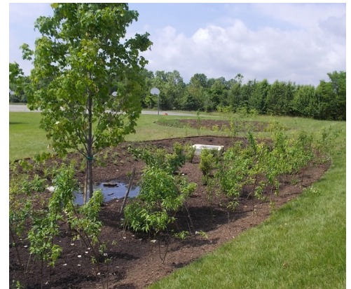
Completed bioretention at the Junior Achievement Finance Park, Prince George's County

The CWP is planning, designing and constructing green infrastructure retrofits across 2,000 acres of impervious surfaces in Prince George's County. Here are some of our most recent projects.