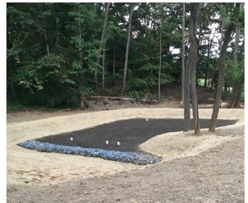
Micro-bioretention at the Cheverly Public Works Yard