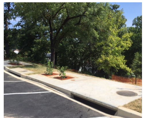
Two rotondo bio-pod tree box filters installed at St. Ambrose Catholic Church